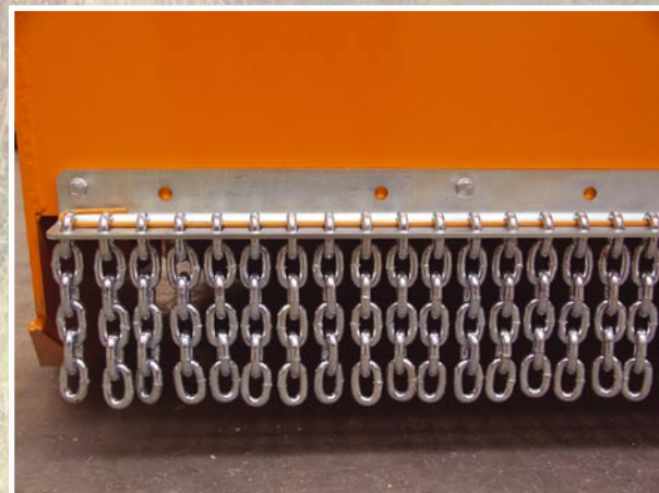
Chain guard on cutting-head front side