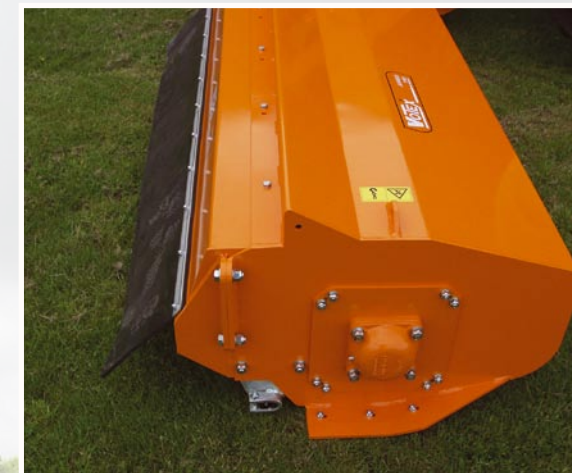
Modular cutting head