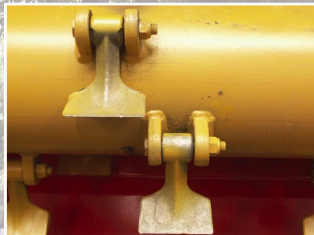
Hammerflail 1300 gram