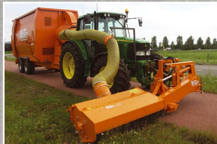
Front mounted with mobile suction unit