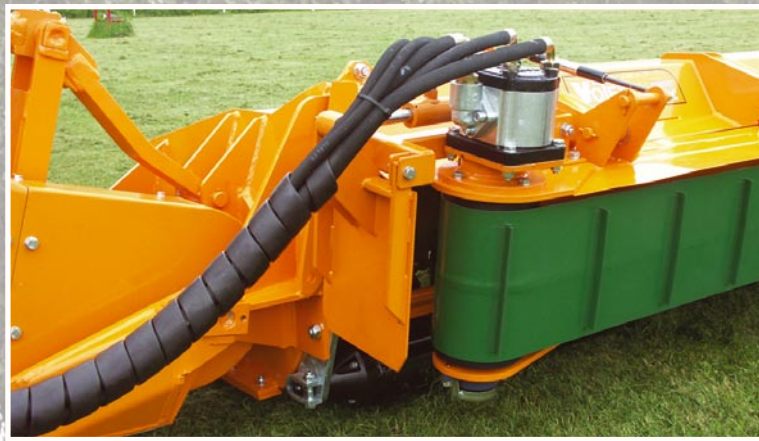
Modular cutting head with grass-discharge belt and grass guide