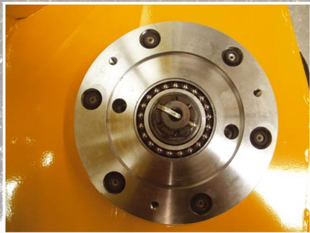
Flexible coupling between gearbox and rotor shaft