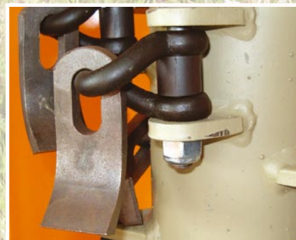
Votex 40x12 flail