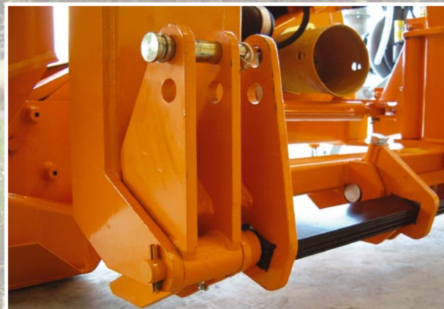
Collision protection using torsion springs Safety when driving forwards and backwards