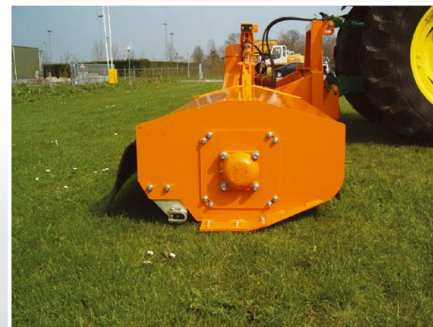
Standard cutting head

Installing a modular head considerably increases the range of application of the Votex Jumbo! The modular head is provided with a removable back where both a grass-discharge belt or a screw-feed box for grass suction can be fitted.