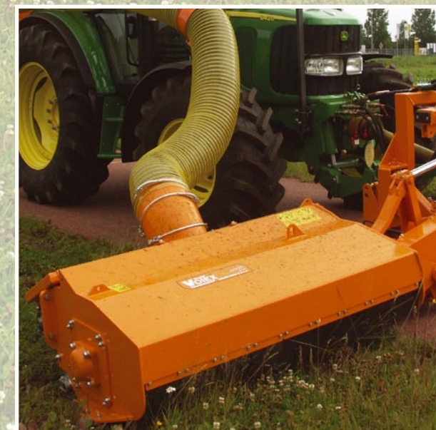
Modular cutting head with screw feeder and suction unit

The screw feeder can be driven hydraulically by the tractor or by its own hydraulic system. It moves the grass to the suction-hose connection in the centre of the cutting head. The screw-feeder box is provided at the back with three hatches so that the screw-feeder compartment can be cleaned easily.