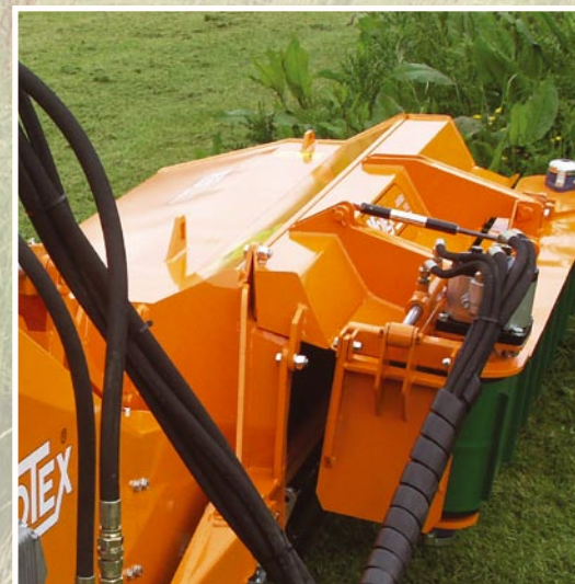
Modular head with grass-discharge belt

The Votex grass-discharge belt is mounted to the back of the modular head and can be provided with its own hydraulic system with an 80-litre oil tank. The hydraulic pump is then driven by the tractor, using an extended drive shaft. It is also possible to use the tractor hydraulic system for the drive. The discharge belt can run in two directions, and is provided with continuously variable speed control up to 2000 revolutions per minute. The grass-discharge belt throws the cut grass on a swath to be easily collected and removed afterwards.